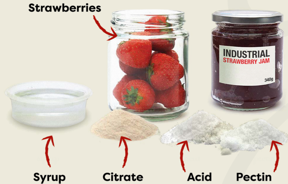
Industrial Strawberry Jam Prepared with 40g fruit per 100g