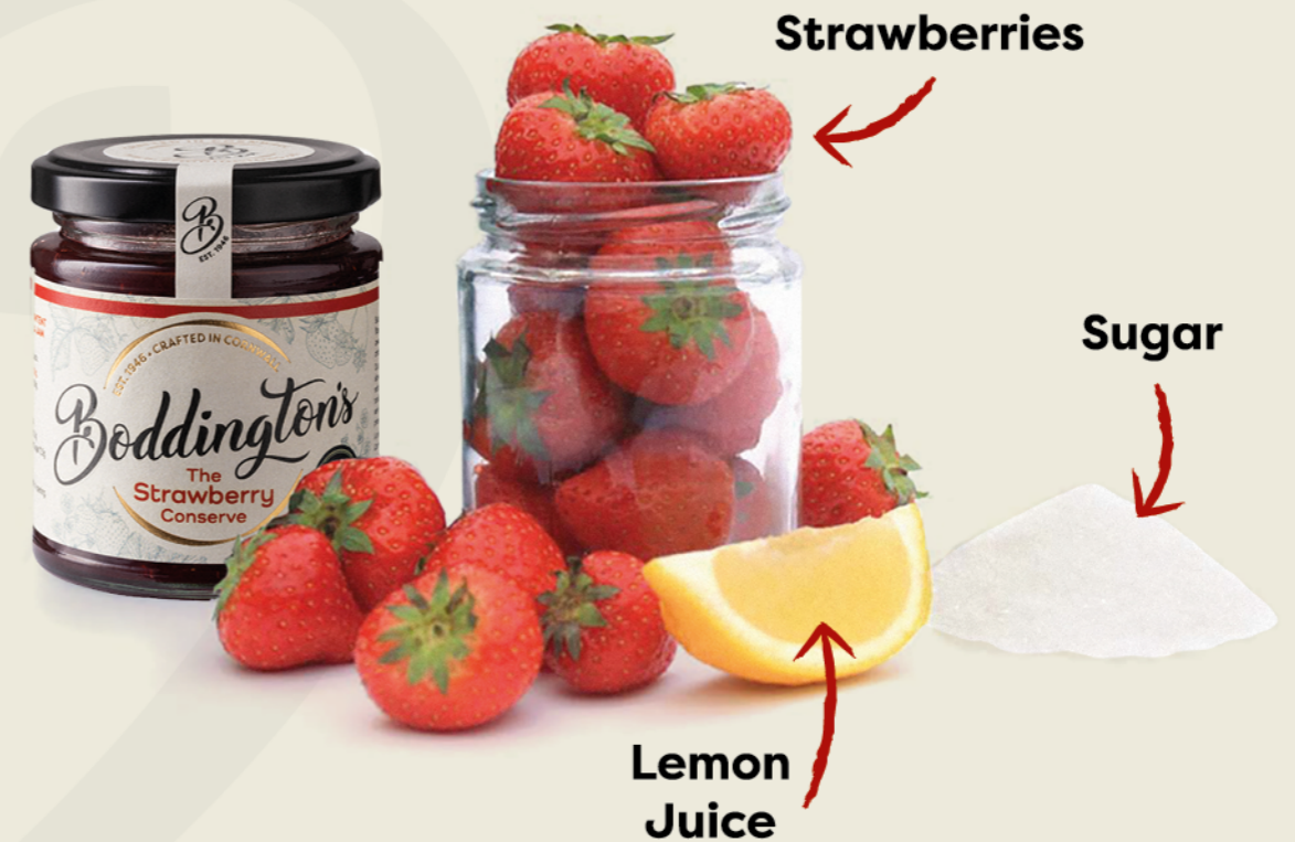
Boddington's Strawberry Conserve Prepared with 80g fruit per 100g